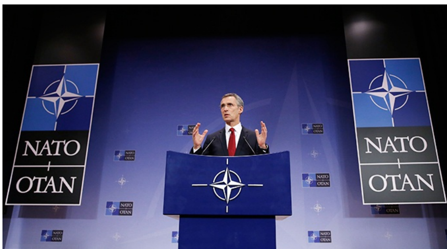
NATO Secretary General Jens Stoltenberg

The current privileged scenario is Russia playing for time until it has totally sealed Russia's air space to American ICBMs, stealth aircraft and cruise missiles – via the S-500 system.