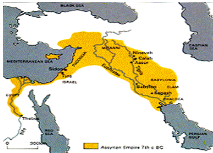
Map of Assyria (1350 - 612 BC)