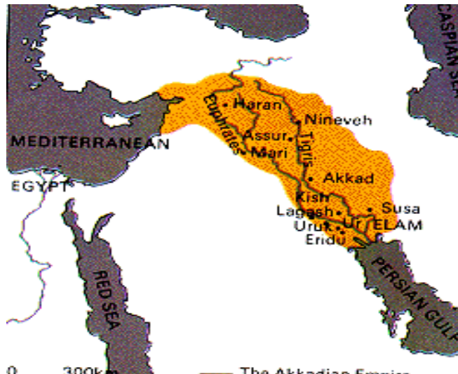
Map of Akkadian dynasty (2340 - 2180 BC)