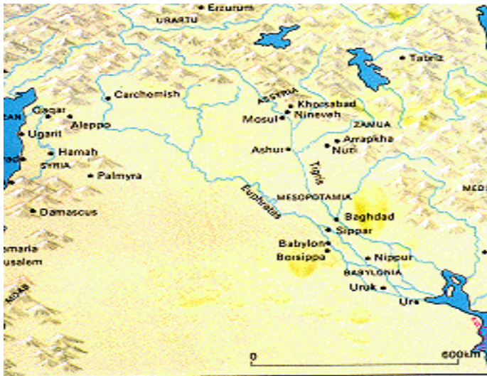
Map of Mesopotamia